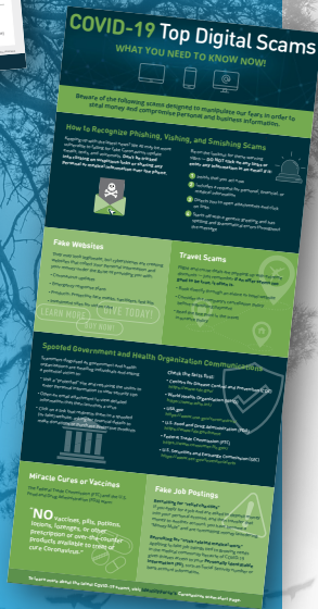
Infographic | Top COVID-19 Digital Scams

Now is the time to take protecting all you've built seriously. Your company recognizes the exponential increase in fraud and scams as your digital footprint expands, and the vulnerabilities that result from having sensitive personal information exposed. It's why IdentityForce is part of the employee benefit wheelhouse. We're here to provide you with world-class identity theft protection plans built to proactively monitor, alert, and help you fix any identity theft compromises.